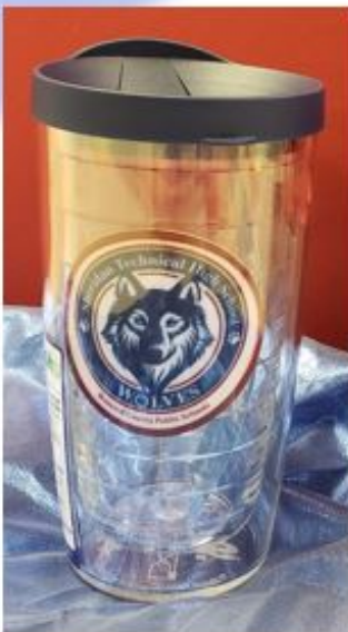
The 16 oz. sells for only $18.

Show your school spirit and look cool with these exclusive, limited edition Sheridan Tech tumblers. Keep your hot drinks hot and your cold drinks cold! Each double-wall insulated tumbler is dishwasher safe and comes with a lifetime warranty. They are also the only beverage holder that is classroom approved!