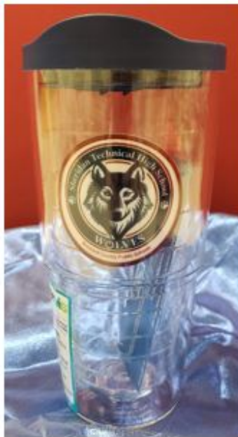
The 24 oz is $20