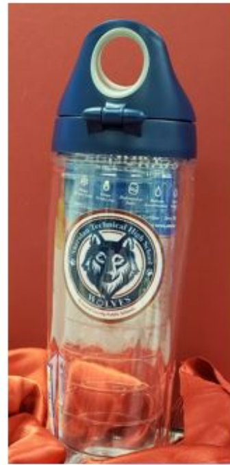
The water bottle is $22